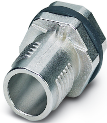
M12-SPEEDCON housing screw connection for M12 male inserts, with flat gasket, for all Speedcon-compatible THR and wave soldering contact carriers

Please be informed that the data shown in this PDF Document is generated from our Online Catalog. Please find the complete data in the user's documentation. Our General Terms of Use for Downloads are valid ( http://phoenixcontact.com/download )